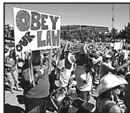
ARIZONA IMMIGRATION LAW