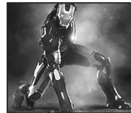
PAGE 9 MOVIE REVIEW: IRON MAN 2

PLACENTIA'S OLDEST CONTINUOUSLY RUNNING NEWSPAPER, EL TIGRE IS A STUDENT-RUN NEWSPAPER IN THE PLACENTIA-YORBA LINDA UNIFIED SCHOOL DISTRICT